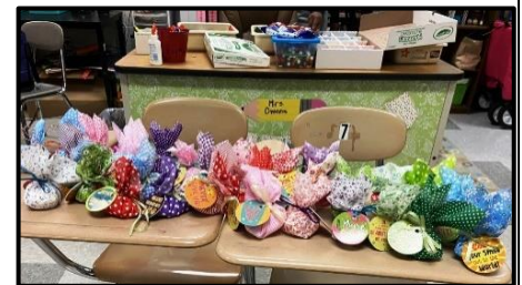
Finished Sachet Project

We asked the Juniorettes whether any of them knew of someone who has received Meals on Wheels services. One said she had heard of Meals on Wheels and knew it was for people who are not able to leave their homes. This was our opportunity to let them know that the meals service