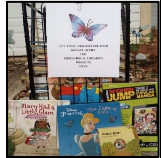
Books donated for WFWC Books for Laundromats